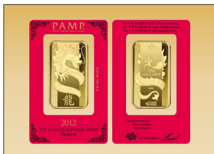
Each bar is sealed in CertiPAMP packaging.

The 12 animals in the 12-year lunar cycle: Rat, Ox, Tiger, Rabbit, Dragon, Snake, Horse, Goat, Monkey, Rooster, Dog, Pig.