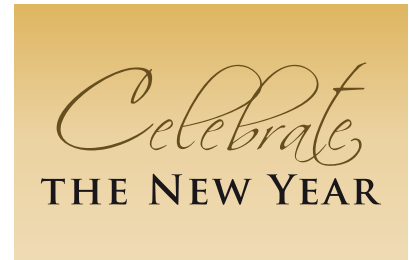
PAMP issued Year of the Dragon bars in November 2011.