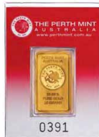
The Perth Mint launched its “Oriana” range of minted gold bars in 2006.

*During 2008, the 1 oz Oriana bar will adopt the dimensions of the standard 1 oz bar: 41 x 34 x 3.5 mm.