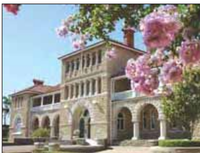
The Perth Mint is located in Perth, the capital city of Western Australia.