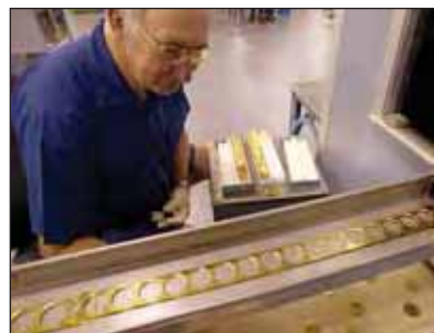
The Perth Mint has minted legal tender gold coins since 1899.