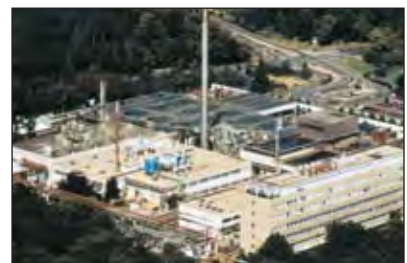
The Precious Metals Plant Wolfgang, where cast bars were manufactured, in 1990.