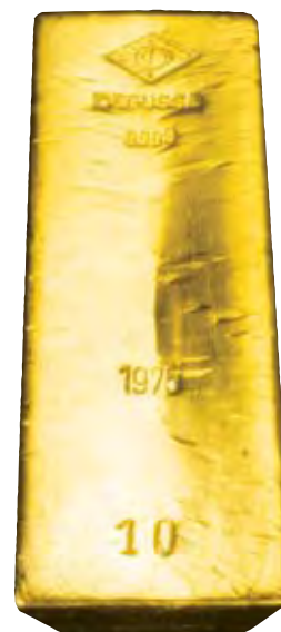
The company had manufactured London Good Delivery 400 oz bars since 1930 est.

Customized bars were also manufactured for external entities.