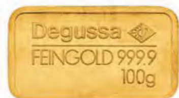
Degussa-branded gold bars were last issued in 2005.