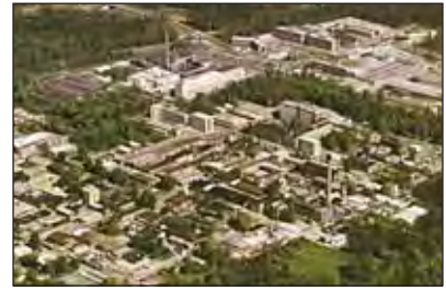
Degussa was one of the world’s largest precious metals groups. Its site in Hanau in 1990.