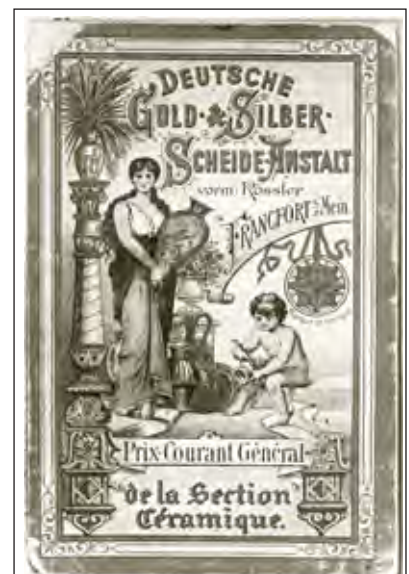
The company was incorporated in 1873. The name was abbreviated to Degussa AG in 1980.