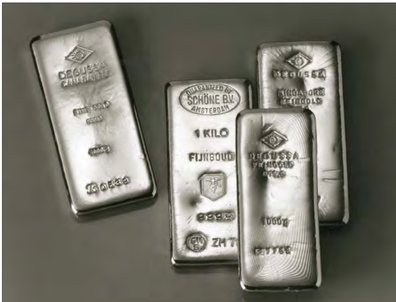
Kilobars manufactured at Degussa's LBMA-accredited refineries in Canada, Netherlands, Germany and Singapore.