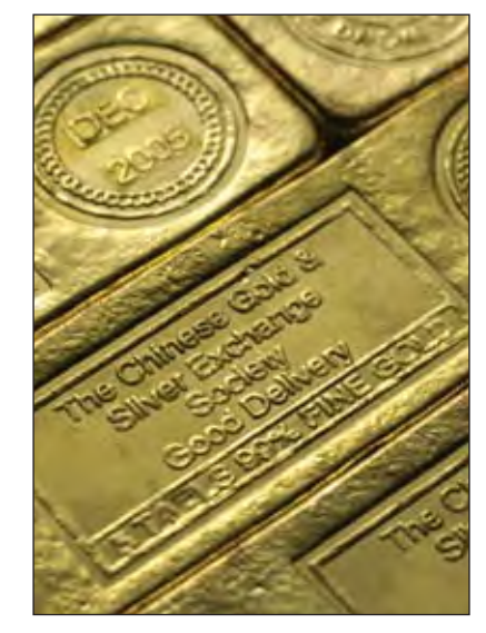
Hong Kong Good Delivery 5 tael bars are stamped by the CGSE.

Illustrating past and current CGSE official stamps.