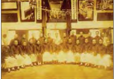
Historical photographs associated with the CGSE.