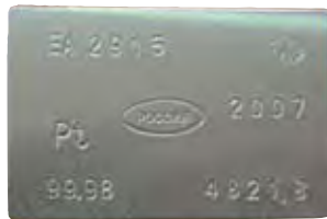
London/Zurich Good Delivery platinum bar.

Apart from gold bars, the company manufactures an extensive range of gold products for the jewellery, electronics, dental and other industries.