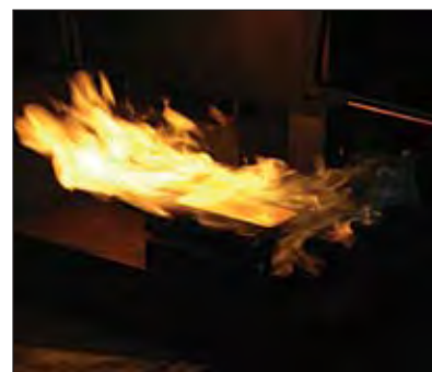
Manufacturing London Good Delivery 400 oz bars.