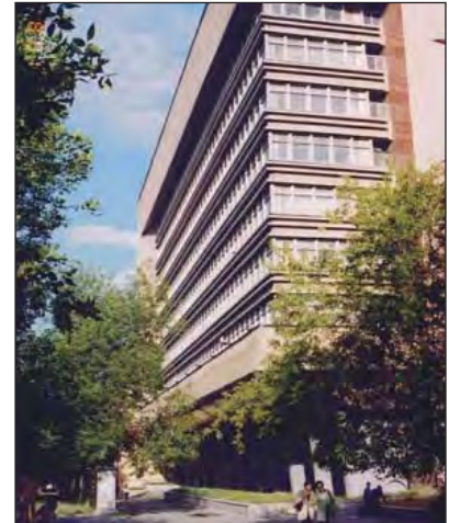
The Ekaterinburg plant was founded during the reign of Tzar Nicholas II in 1916.

Apart from gold refining, the recycling of scrap and the manufacture of bars, the company also manufactures other gold products for the jewellery industry (rolled products, wire), electronics industry (contacts, foil, wire), dental industry (belts, wire) and other industrial industries (anodes, granules, flat belts).