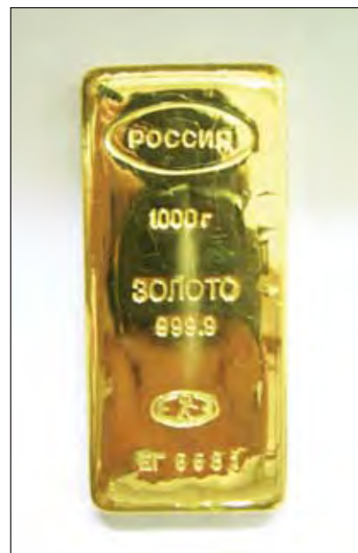
Kilobars have been issued with the company's official stamp since 1996.