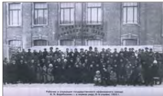
Employees at the plant, when it was known as the "National Refinery Plant", in 1922.

The company has been accredited to the London Platinum and Palladium Market for platinum bars since 2000 and for palladium bars since 2001.