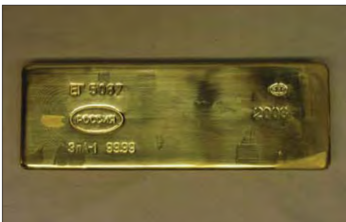
London Good Delivery 400 oz bars have been manufactured since the early 1980s.