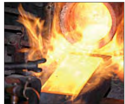
The company is the longest-established gold refiner in the Russian Federation.