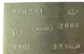
London/Zurich Good Delivery palladium bar.

The company has been accredited to the London Platinum and Palladium Market for platinum bars since 2000 and for palladium bars since 2001.