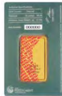
If the security case is opened, the graphic pattern is revealed as ruptured under ultraviolet light.