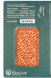
Illustrating the invisible graphic pattern on the seal card, when the security case is sealed.