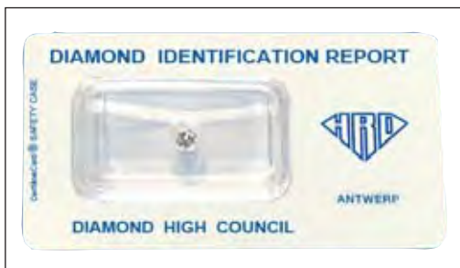
Certiline also produces CertiCard® security cases for diamonds and coloured stones, jewellery, pearls, coins, stamps and other products.