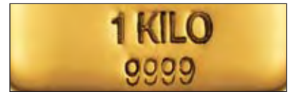
Kilobars are manufactured for the international market to a fineness of 995 or 999.9.

The Perth Mint also manufactures customized cast and minted bars for external entities, on request, to precise or irregular weights.