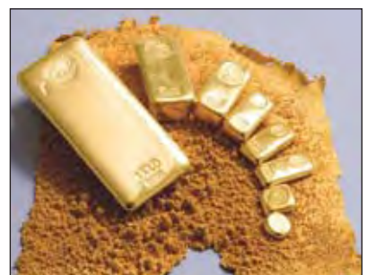
The Perth Mint is a major manufacturer of small cast bars, 1000 g and less.