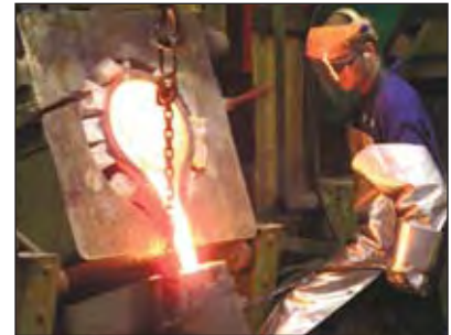
The Perth Mint is the only major gold refiner in Australia, one of the world's leading gold producing countries.

In 1988, under the Gold Banking Corporation Act 1987 (Western Australia) , Gold Corporation (GC) was established as a wholly owned government institution. The Western Australian Mint, which included Australian Gold Refineries (AGR), was established as GC's new subsidiary body responsible for all refining operations, including those at The Perth Mint.