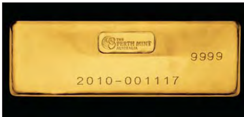
London Good Delivery 400 oz bar.

The current official stamp, which has been applied to smaller cast bars since 1972, will be changed during the course of 2010.