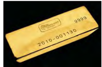
The new official stamp of The Perth Mint has been applied to London Good Delivery 400 oz bars since March 2010.