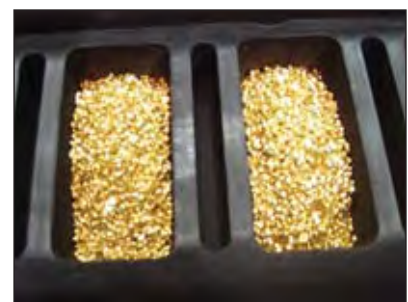
Bar moulds containing exactly a kilo of gold granules prior to melting.

In 1976, following Australian legislation authorizing private gold ownership, 7 ounce-denominated cast bars were issued: 50 oz, 20 oz, 10 oz, 5 oz, 2 1/2 oz, 1 oz and 1/2 oz.