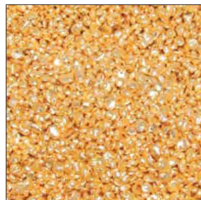
Gold granules for the jewellery industry.

On cast and minted bars, 50 oz and less, issued by The Perth Mint since 2010.