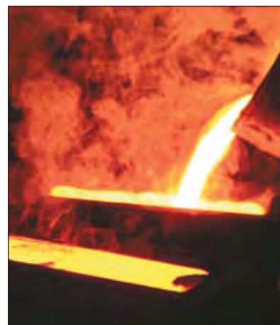
The large refinery near the Perth Airport was opened in 1989.