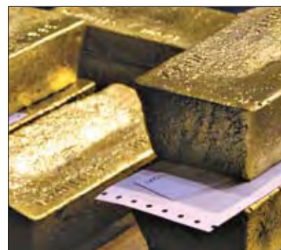
Newly-mined low purity doré bars.

Annual gold refining capacity is in excess of 300 tonnes.