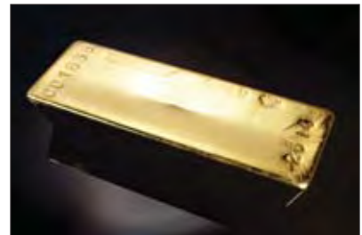
The refinery in Singapore has manufactured London Good Delivery bars since July 2014.