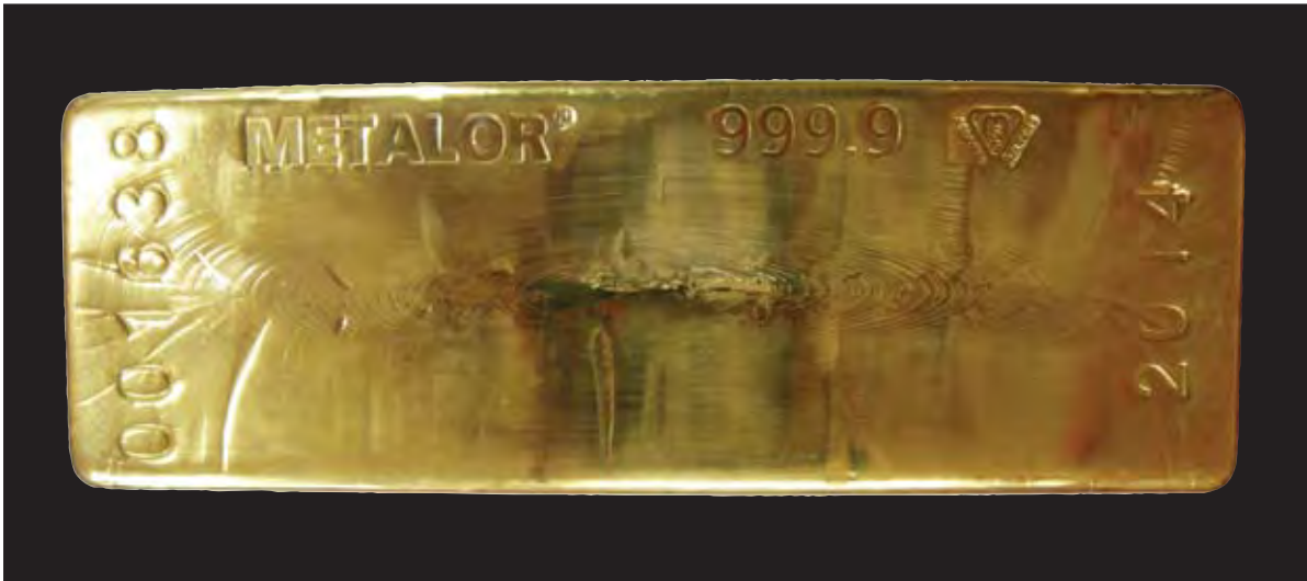
London Good Delivery 400 oz