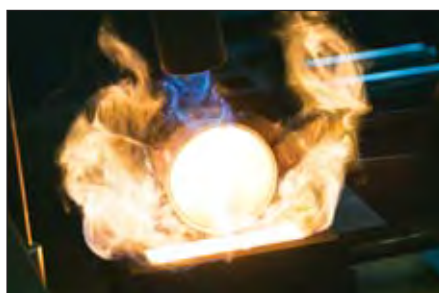
Pouring London Good Delivery 400 oz bars.

Metalor Technologies Singapore Pte Ltd is the only major gold refiner in Singapore.