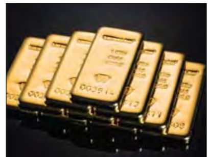
Kilobars have been produced for the international market since 2013.