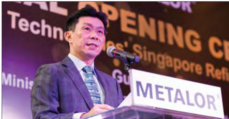
Mr Lee Yi Shyan, Senior Minister of State for Trade & Industry and National Development in Singapore.