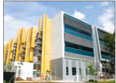
The Metalor Refining Group started to refine gold and manufacture bars in Singapore in 2013.