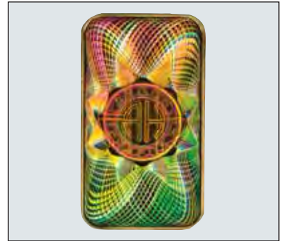
The kinebar® celebrates its 20th Anniversary in 2013.

Argor-Heraeus applies kinegrams® to its own range of minted bars, as well as to those of two of its major shareholders, Heraeus Holding GmbH and the Austrian Mint: