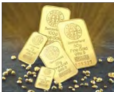
Kinebars® can range in weight from 1 g up to 1000 g.