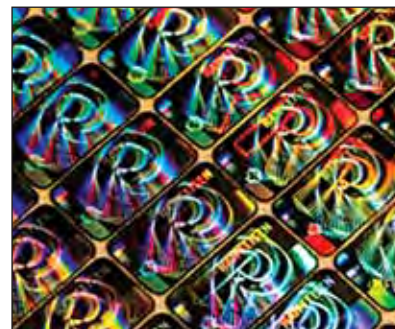
Argor-Heraeus is renowned as the world's only manufacturer of kinebars®.

Many of the customized bars, manufactured for external entities, adopt the same dimensions.