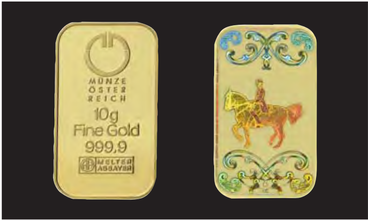
The Austrian Mint has issued kinebars® since 1995.