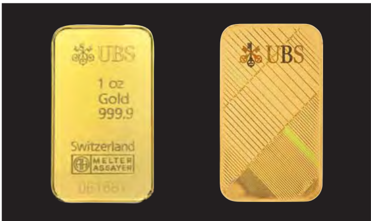
UBS has issued its current range of kinebars® since 1998.