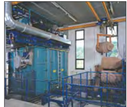
The refinery focuses on the recycling of scrap gold.