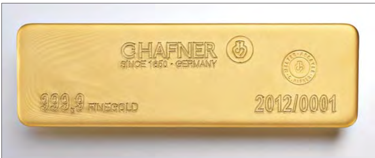
London Good Delivery 400 oz bar