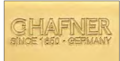
Hafner, founded in 1850, is the oldest family-owned gold refining company in Germany.

The company, headquartered in Bleich-Strasse since 1951, focuses on the recycling of precious metals, alongside the supply of products and services for the jewellery, watch, dental, electrical, decorative and other industries that use precious metals.