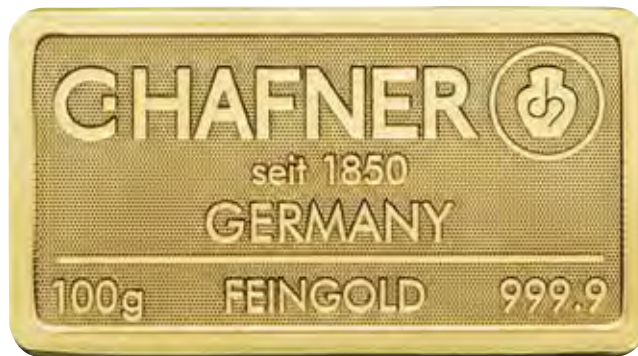
100 g - Obverse