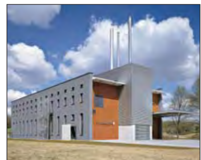
Hafner has refined gold at its current refinery in Pforzheim since 1997.