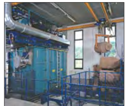
The refinery focuses on the recycling of scrap gold.