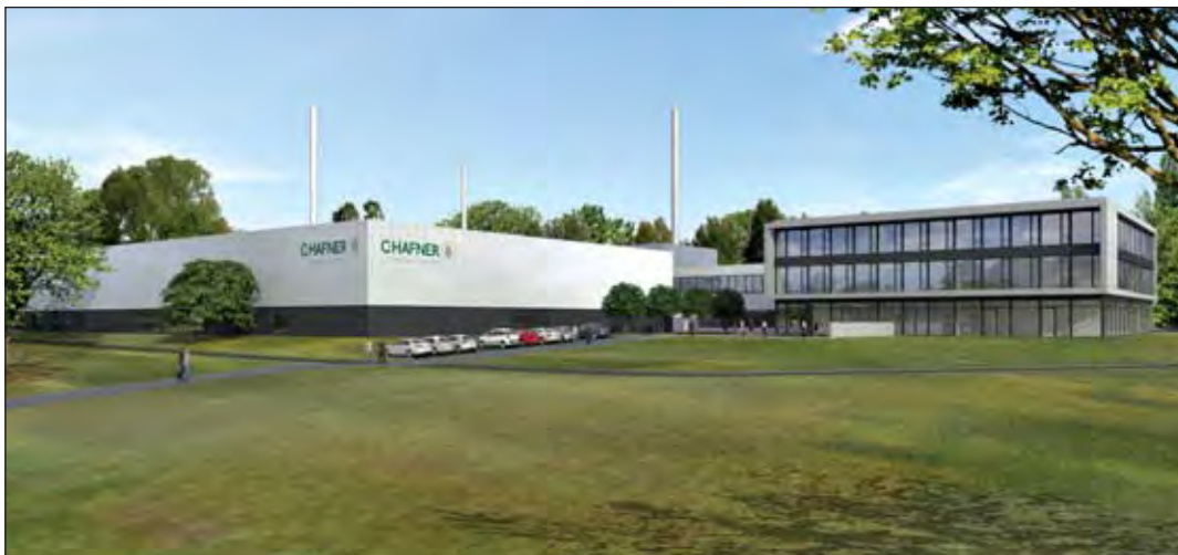
Illustrating the new refining and production plant, scheduled for completion in 2015, in Wimsheim.