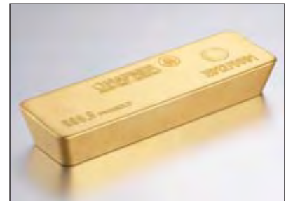
The company was authorized to manufacture London Good Delivery 400 oz bars in 2013.