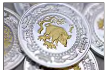
Hafner also manufactures medallions for external entities.