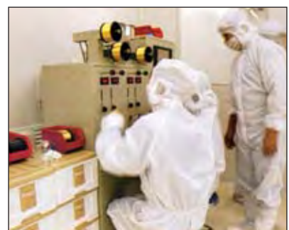
The company also manufactures industrial gold products, including gold bonding wire for the electronics industry.