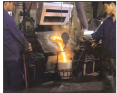
The refinery was relocated to Chengdu in 1993.