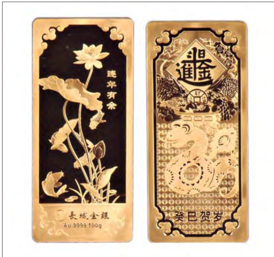
Lunar Calendar bars – Year of the Snake.