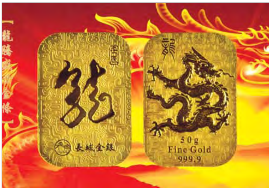
Lunar Calendar bars – Year of the Dragon.

Typical weights: 500 g, 200 g, 100 g, 50 g