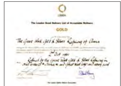
LBMA certificate that records the company's refinery as having manufactured London Good Delivery 400 oz gold bars since 1961.

In 2005, the company pioneered the manufacture of an innovative bar that is cast in a mould and then minted and polished. It manufactures these high quality bars as customized bars for many banks, mainly in the following weights: 500 g, 200 g, 100 g and 50 g.