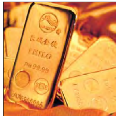
Kilobars were first manufactured in the 1990s.