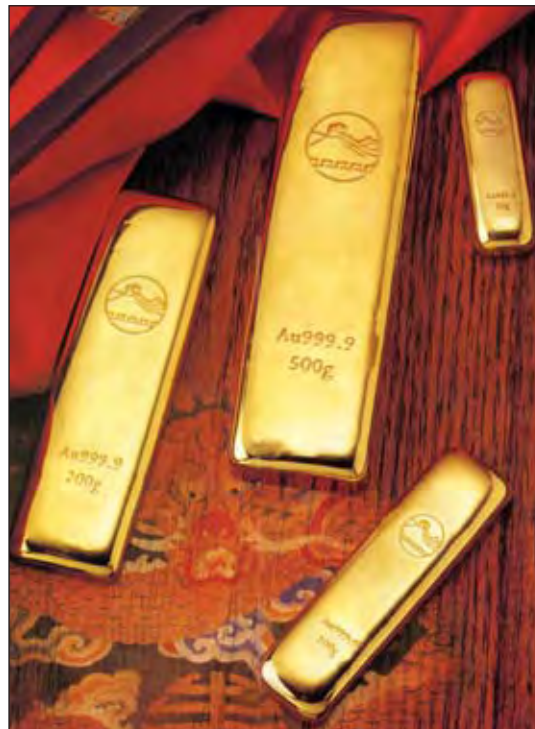
500 g, 200 g, 100 g and 50 g