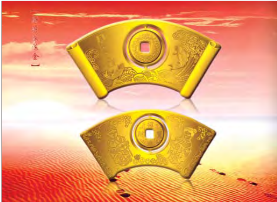
"Scroll" bars which illustrate an historical form of documentation.