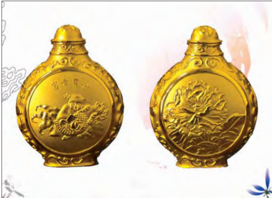
Flat "Flask" bars.