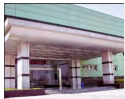
The company has its headquarters in Chengdu, China's 4th largest city.