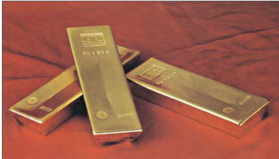
Historical London Good Delivery 400 oz bars bearing an official stamp that was applied by the Refinery of China until 2000.