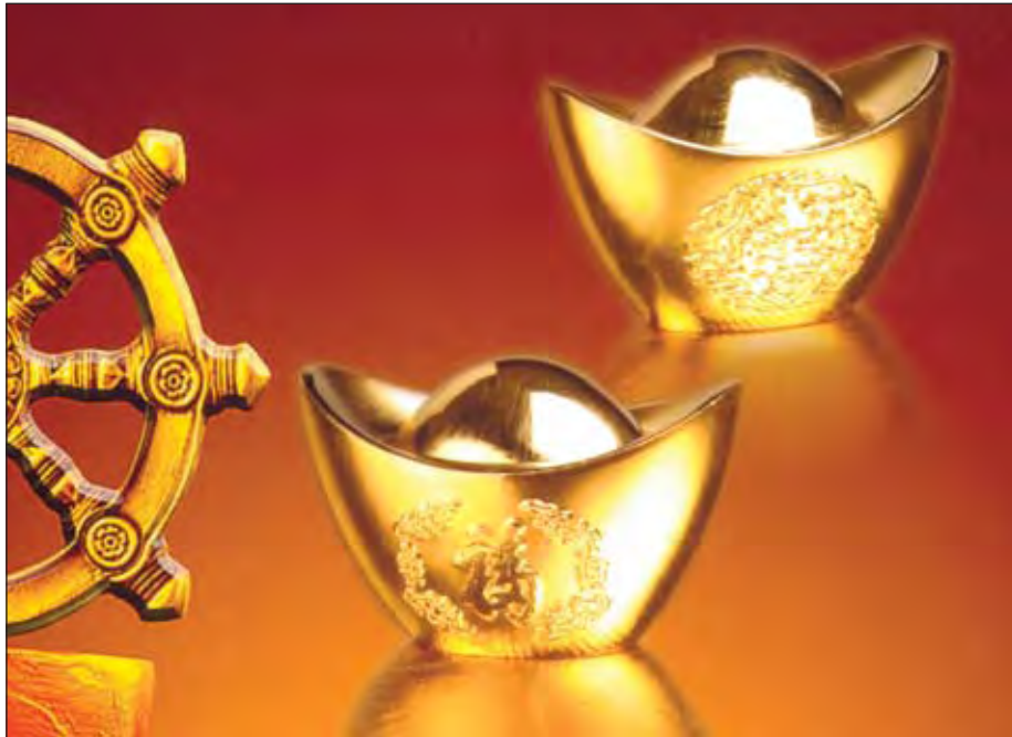
"Boat" bars which resemble the shape of traditional Chinese junks.