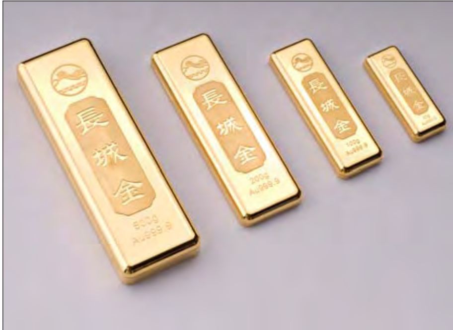
Customized cast-then-minted bars are manufactured for many banks.