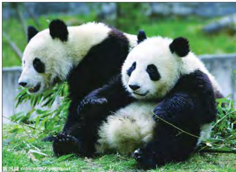
Chengdu in Sichuan Province is renowned as the location of China's Panda Breeding and Research Centre, a 37-hectare (92-acre) facility, 10 km from the city centre.

There are only about 1,500 Giant Pandas in China, 80% living in bamboo groves in Sichuan Province.