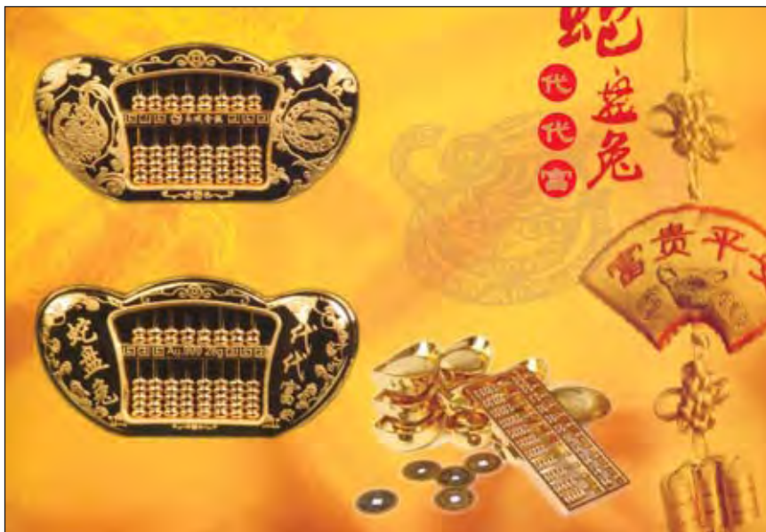
"Abacus" bars which illustrate an historical form of computation.