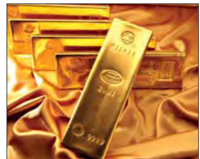
The refinery has manufactured London Good Delivery 400 oz bars since 1961.

It was previously known as the Refinery of China.