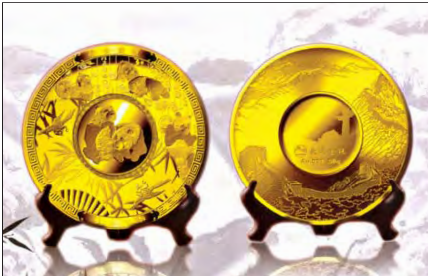
Decorative round bars.