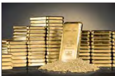
The company's kilobars were rebranded in 2012.