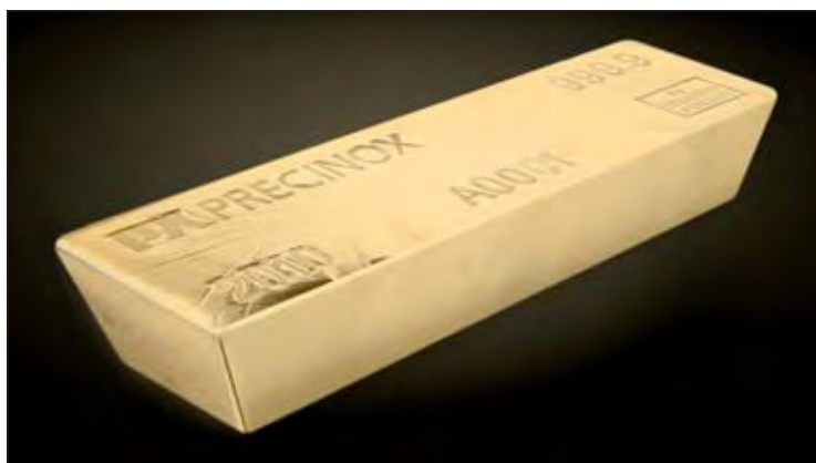
London Good Delivery 400 oz bar