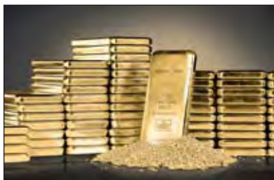
The company's kilobars were rebranded in 2012.