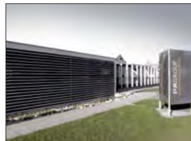
The PX Group is headquartered in La Chaux-de-Fonds, the centre of the gold watch-making industry in Switzerland.

#PX Tools SA had originally been established in 1952. *Marin (canton of Neuchâtel), Bulle (canton of Friburg).