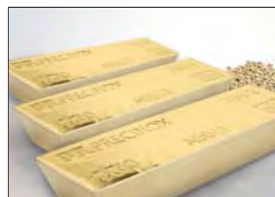
PX Precinox SA has been authorized to manufacture London Good Delivery 400 oz gold bars since 2012.