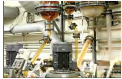
The company has refined gold in La Chaux-de-Fonds since 1978.