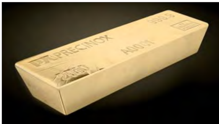
London Good Delivery 400 oz bar