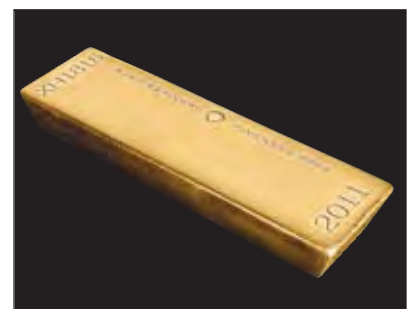
Rand Refinery has manufactured London Good Delivery 400 oz bars since 1921.

Refer to disclaimer on website: www.goldbarsworldwide.com