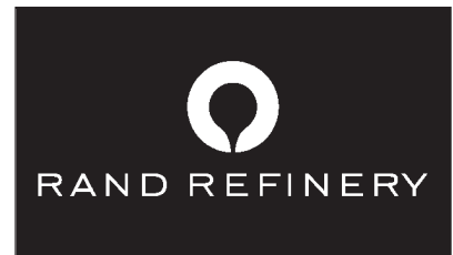
Rand Refinery launched its new logo in September 2011.

Rand Refinery, which is based in Germiston, near Johannesburg, has refined almost one third of all gold ever mined.