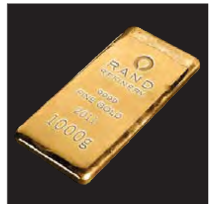
Illustrating the new official stamp that is applied to kilobars.