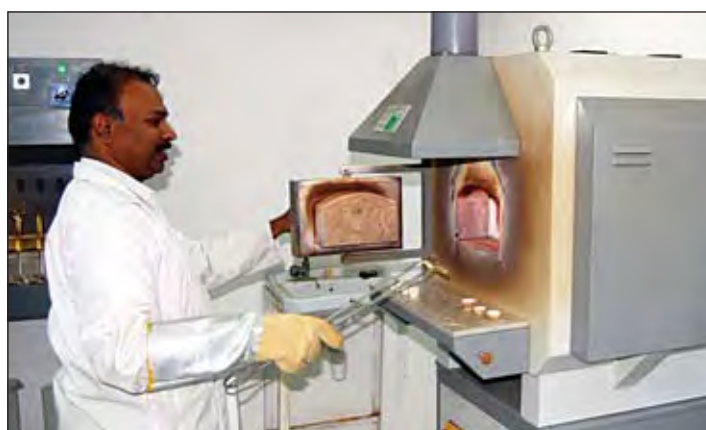
Al Ghaith Gold DMCC is currently located in temporary premises in Dubai's Al Quoz Industrial Area.