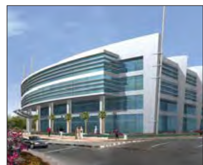
The company's new refinery, under construction in Dubai, is expected to open in 2011.