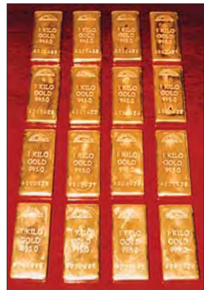
Kilobars are manufactured mainly for dealers and fabricators in the UAE and Middle East.