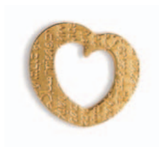
Wave of Emotion 2.4 g