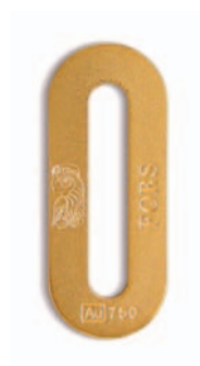
Universe 4 g