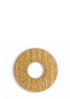
Plenty 2 g