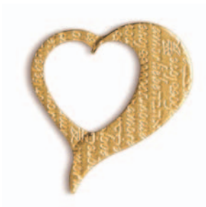
Flame of Love 4 g