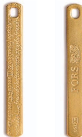
Èternel 6.5 g

The bars in this bulletin are shown 150% to actual size.