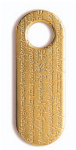
lcône 15 g