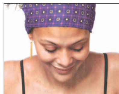
FORS talisman bars, launched in 2006, are also worn as pendants.