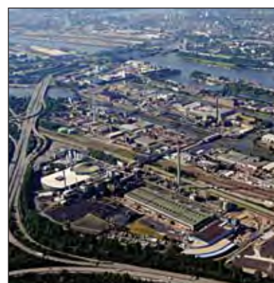
Aurubis AG has its international headquarters in Hamburg.

Aurubis AG, the largest copper producing company in Europe, has been known by this name since 2009.