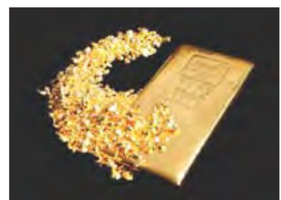
Kilobars are manufactured to a fineness of 999.9 for the international market.