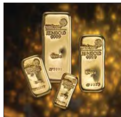
The new range of small cast bars was issued in 2006.

It can be noted that, while the refineries in Belgium and the Netherlands issue 400 oz bars with a "Umicore" stamp, the company's subsidiary company in Germany, Allgemeine Gold- und Silberscheideanstalt AG, issues 400 oz bars with an "Allgemeine" stamp.