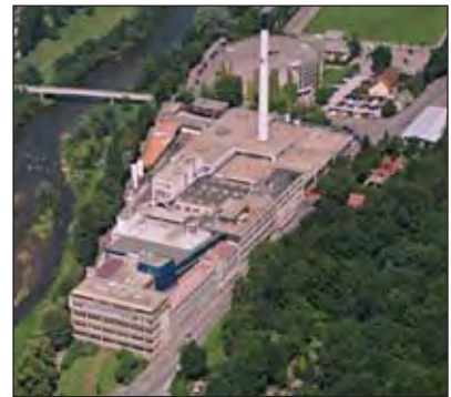
Umicore's gold refining and manufacturing plant in Pforzheim (Germany).

Annual gold refining capacity at its European refineries is more than 150 tonnes.