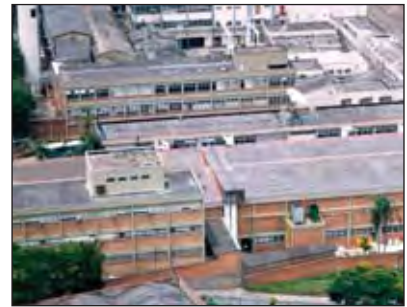
Umicore Brasil Ltda traces its origins in Brazil back to 1953.