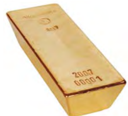
London Good Delivery 400 oz bar manufactured by the Umicore Group in Pforzheim (Germany).