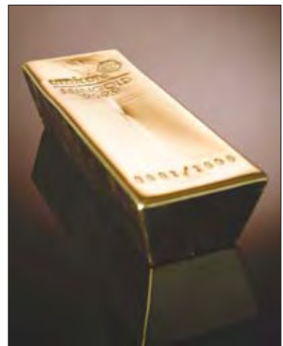
London Good Delivery 400 oz bar manufactured by the Umicore Group in Amsterdam (Netherlands).