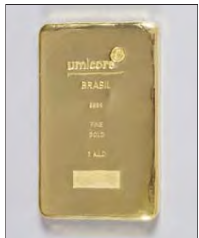
Kilobars with the new Umicore stamp were issued in 2006.