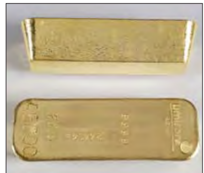
The refinery has manufactured London Good Delivery bars since 1992.