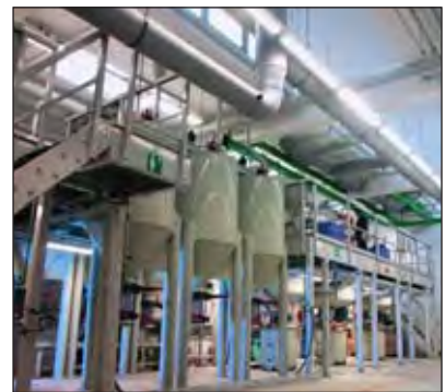
The Pforzheim refinery has refined gold for more than a century.