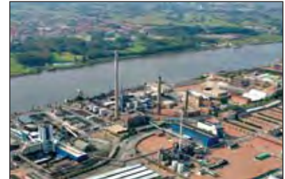
Umicore SA's large metal manufacturing complex in Hoboken.