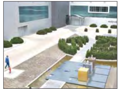
Umicore SA has been an international gold refiner for more than 75 years.

The company was founded in Pforzheim, the centre of the jewellery and watchmaking industry in Germany, in 1891. Apart from Schöne Edelmetaal BV (Netherlands), two other subsidiaries have gold refineries: Österreichische Gold- und Silberscheideanstalt Ges.m.b.H (ÖGUSSA) in Vienna (Austria), and Umicore Precious Metals (Thailand) Ltd in Bangkok. It became part of the Umicore Group in 2003.