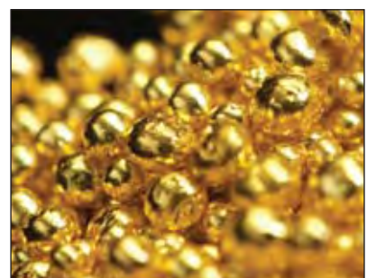
Gold granules for the jewellery industry.