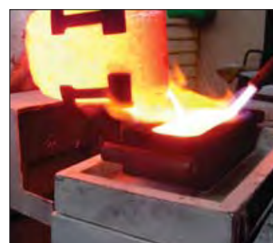
Pouring molten gold. The refinery in Guarulhos was established in 1979.