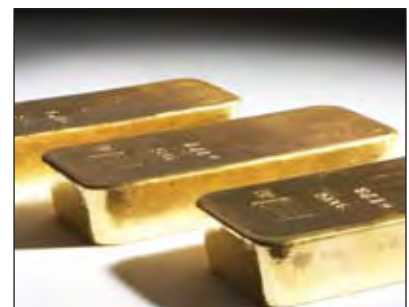
The company has produced London Good Delivery 400 oz bars in Hoboken since 1930.