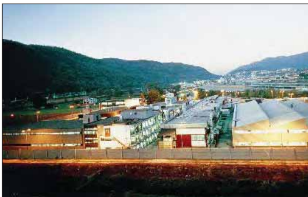
Valcambi has been a major refiner and bar manufacturer for more than 40 years.