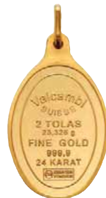
Pendant oval products incorporate a hook.