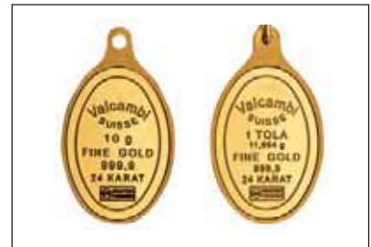
Valcambi launched its range of minted oval gold investment products in 2007.

Examples of the new oval products have been included in the Industry Collection.