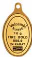
10 g Obverse