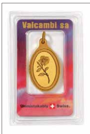
10 g Reverse