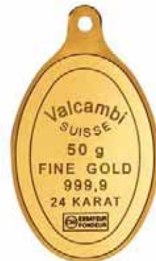
Standard oval products includes a circular hole.