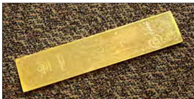
Long, flat 3000 g bars are produced by manufacturers accredited to the SGE and SHFE in China.

* Also accredited to LBMA (6 refiners)