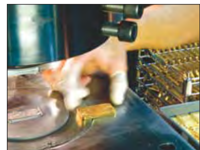
Manufacturing minted bars at PAMP (Switzerland).