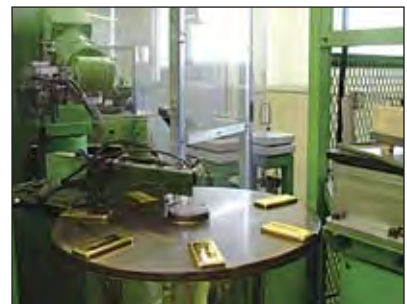
Manufacturing kilobars at Tanaka (Japan).