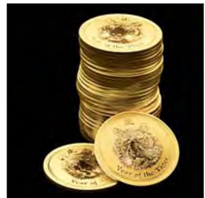
The dimensions of 1 oz bullion coins vary.

The Maple Leaf was the first bullion coin to be issued at a purity of 99.99%.