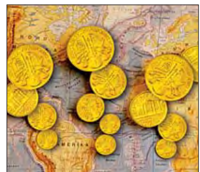
Vienna Philharmonic Austria

The Australian Lunar has the largest diameter.