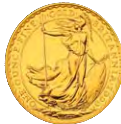
Reverse - 1999