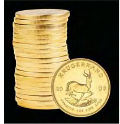
Krugerrand South Africa

In this context, they proposed the minting of a gold “bullion” coin that would contain exactly one troy ounce of fine gold - for issue at a price directly related to the prevailing value of its fine gold content.