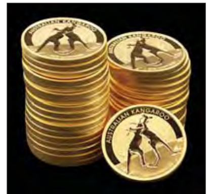
Australian Kangaroo Australia

Gold bullion coins are minted for gold investors – for purchase in small or large quantities.