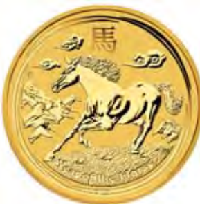
Reverse - 2014