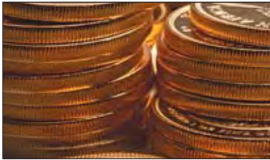
In recent years, over 150 tonnes of gold bullion coins have been minted for the international market each year.