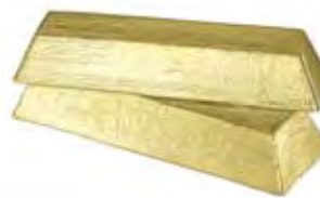
Gold bullion coins are traded on the basis of their fine gold content.

However, its worldwide success stimulated many countries to issue their own ounce-denominated bullion coins, especially when international sanctions were widely applied against South Africa and the Krugerrand between 1985 and the early 1990s.