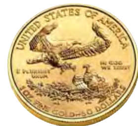
American Eagle USA

Gold bullion coins are issued by many countries for the international market.