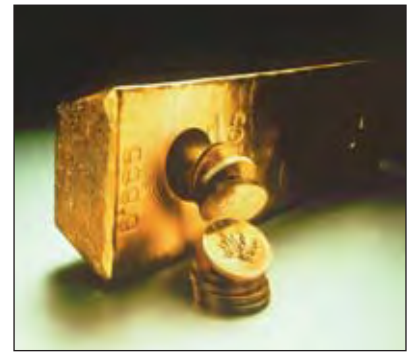
Maple Leaf Canada

It can be noted that, while some countries exempt designated gold bullion coins from import duties and sales taxes (e.g. European Union), other countries levy import duty, sales or other taxes (e.g. many States in the USA, Russia and Japan).