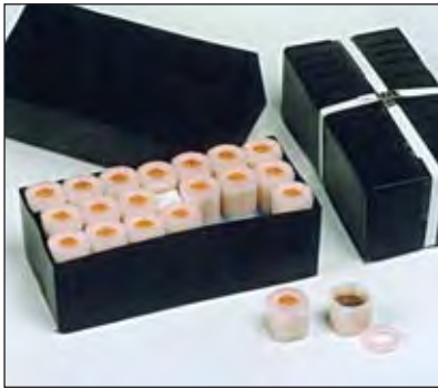
Krugerrand South Africa