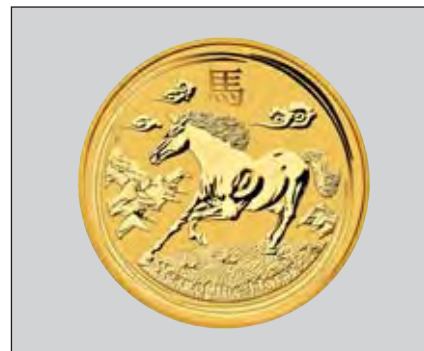
Reverse - 2014 1 kg fine The Perth Mint Australia