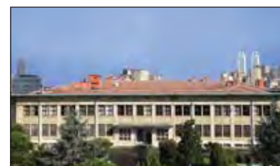
Turkish State Mint Istanbul