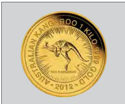
Reverse 1 kg fine The Perth Mint Australia