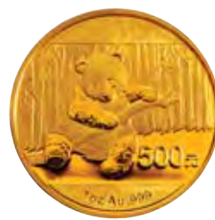
Reverse - 2014