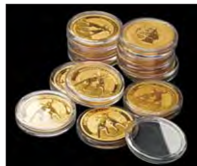
Australian Kangaroo Australia

Ounce-denominated gold bullion coins are normally issued in 4 sizes.