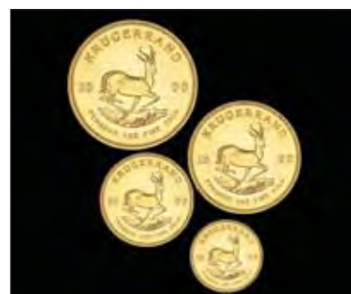
Krugerrand South Africa

They can contain 99.99%, 99.9%, 91.67% or 90% gold.