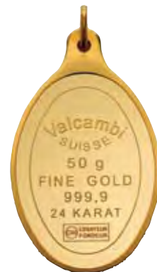
Valcambi (Switzerland) launched an oval range in 2007.