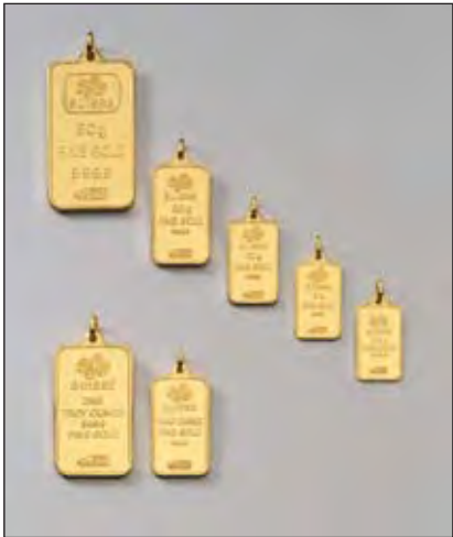
Not in actual size