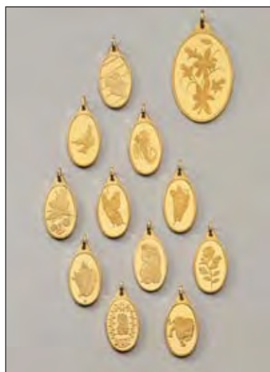
Illustrating decorative designs that are applied to the reverse side of PAMP pendant bars.