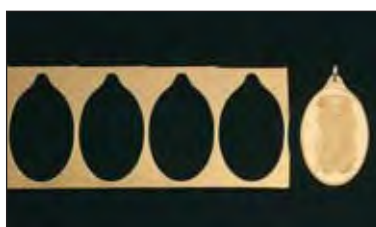
Standard pendant gold bars are normally issued as investment bars that can also be worn.

* The recorded weight of pendant bars in this table excludes the small additional weight of the hanger or hook.