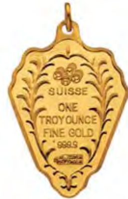
PAMP (Switzerland) issues an extensive range of pendant gold bars: rectangular, oval, lozenge, colonna and heart.

Emirates Gold (UAE) issued its oval range in 1992, while Valcambi (Switzerland) launched its oval range in 2007.