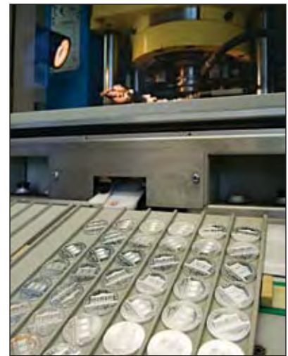
The Mint manufactures gold (and silver) blanks and coins for many other countries around the world.