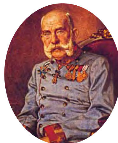
The Dukat restrikes commemorate Emperor Franz Joseph who was on the throne of Austria from 1848 until 1916.

Note: Sales since 2010 not available.