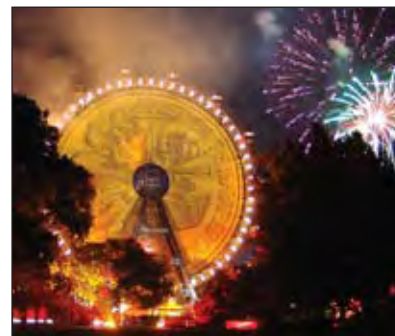
The famous giant wheel, in the Prater area in Vienna, highlighted the 15th Anniversary of the Vienna Philharmonic in 2004.

The monetary face values of Vienna Philharmonic coins were originally denominated in Austrian Schilling. Since 1 January 2002, the face values have been denominated in Euro: