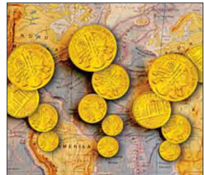
Vienna Philharmonics are widely traded in Europe, North America and the Far East.