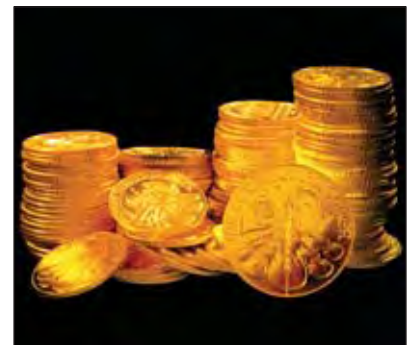
More than 15 million Vienna Philharmonics have been minted for the international gold market.