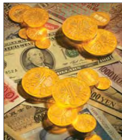
The legal tender status of the Vienna Philharmonic is recorded in the Currency Act 1988.

When launched in 1989, the 1 oz Vienna Philharmonic had the world's largest diameter (37 mm) for a gold bullion coin.