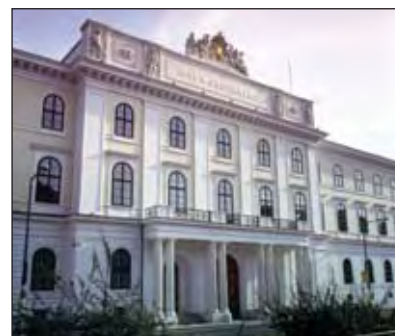
The Austrian Mint is a public company wholly owned by the Austrian National Bank.