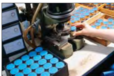
Packing 1 oz Vienna Philharmonics into tubes for the international market.

As many distributors trade internationally, Vienna Philharmonic coins are widely available in many other countries around the world.