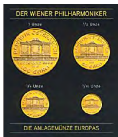
Standard Vienna Philharmonics contain exactly 1 oz, 1/2 oz, 1/4 oz or 1/10 oz of fine gold.