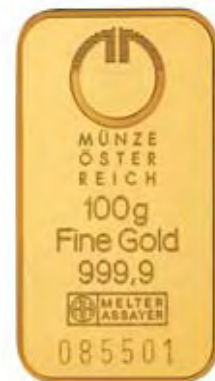
The Mint has issued an extensive range of cast and minted gold bars since 1995.