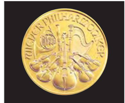
The Austrian Mint, the largest manufacturer of gold bullion coins in Europe, issued the Vienna Philharmonic in 1989.