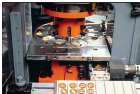
Minting Vienna Philharmonics at the Austrian Mint.

The Austrian Mint has minted 15 million Vienna Philharmonics for the international market since 1989.