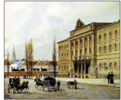
The Austrian Mint, founded in 1194, has been located opposite Vienna's largest public park since 1837.

Since 2002, the Mint has been a major shareholder (23.4%) of Argor-Heraeus SA (Switzerland), a leading international refiner and bar manufacturer for the international market.